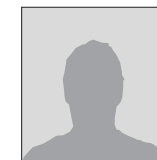
Nn Assistant director People and organisation